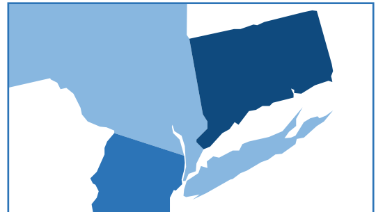
Available in the NYC Metro Area and CT